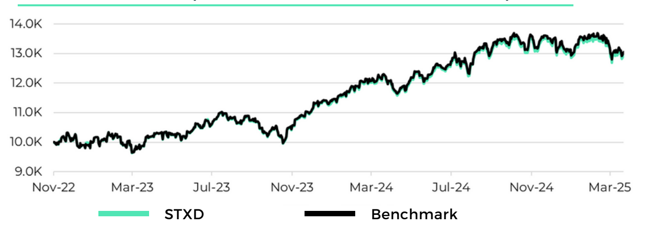
Chart reflects growth of a hypothetical $10,000 investment and assumes reinvestment of dividends and capital gains. Past performance is not indicative of future results. Index performance may differ from fund performance. Indexes are not managed, and one cannot invest directly into an index

Investors should consider the investment objectives, risks, charges and expenses carefully before investing. For a prospectus or summary prospectus with this and other information about the Fund, please call 855-427-7360 or visit our website at www.strivefunds.com. Read the prospectus or summary prospectus carefully before investing.