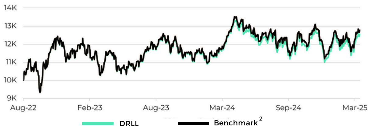
Chart reflects growth of a hypothetical $10,000 investment and assumes reinvestment of dividends and capital gains. Past performance is not indicative of future results. Index performance may differ from fund performance. Indexes are not managed, and one cannot invest directly into an index.

Investors should consider the investment objectives, risks, charges and expenses carefully before investing. For a prospectus or summary prospectus with this and other information about the Fund, please call 855-427-7360 or visit our website at www.strivefunds.com . Read the prospectus or summary prospectus carefully before investing.